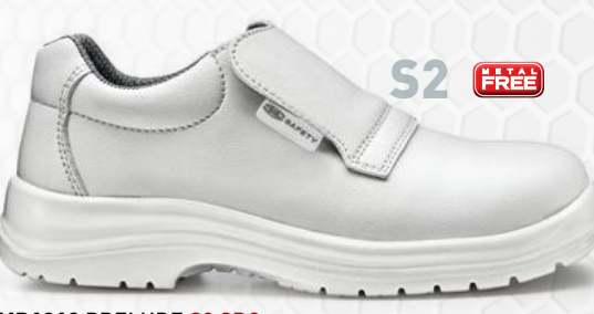
MB1313 PRELUDE S2 SRC