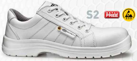
MB1321 WHITE FOBIA S2 SRC