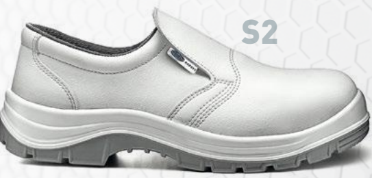
MB1311 EVOK S2 SRC