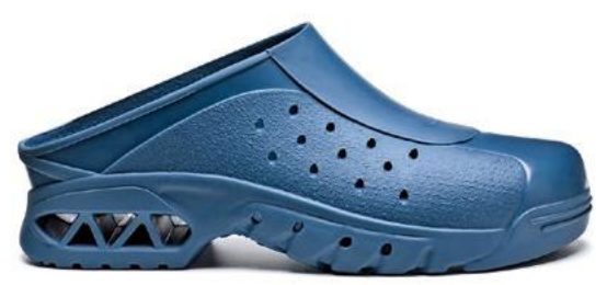
MB1414 ARGON SB A E SRC