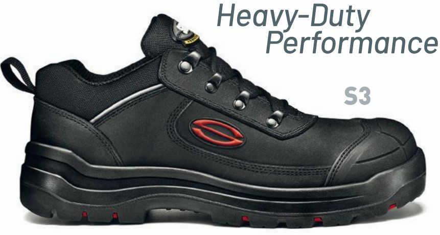
MB2311 OASIS S3 HRO SRC Toecap: glass fibre Puncture-proof: composite Sizes: 39-47