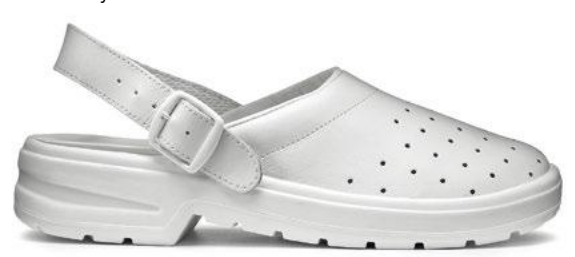
MB1413 RECIFE 02 FO SRC